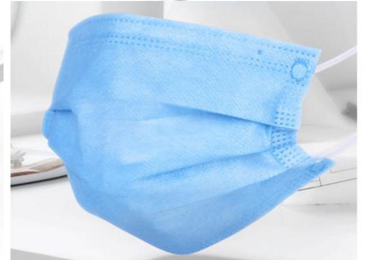
Medical Hygiene Grade Mask